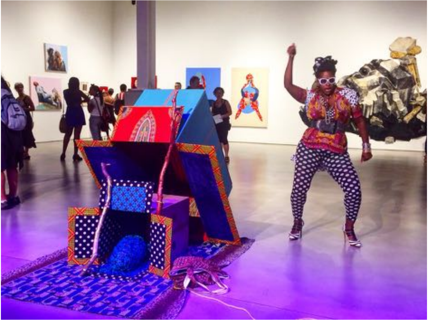
Tricked Out Trap 2016 24 x 32 inches Cibachrome